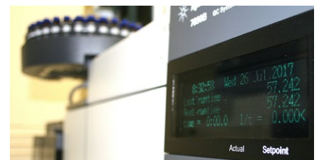
Fugro can provide a flexible service to receive and analyse oil spill samples outside working hours.