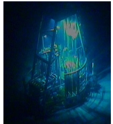
Underwater operation at 1600 m