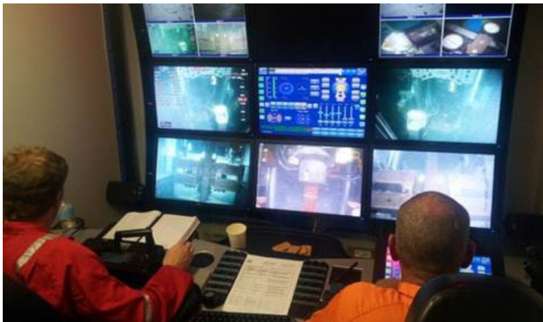
View from the control van.

Approximately 500 m 2 of clear deck space for SFD equipment (including LARS) and support containers