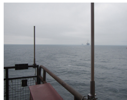
Decommissioning application – platform motion monitoring equipment with Wireless, Satellite or GSM data telemetry

Unmanned platforms are often a solution for minimum cost oil production. As a result of being unmanned, the structural integrity management issues change and the inspection philosophy can include a remote monitoring regime. As an example, collisions between vessels and offshore oil & gas platforms and infrastructure are a major problem, and in some operating regions of the world are reported to cause more damage to structures than the natural environment.