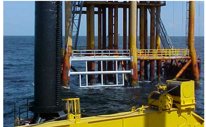
Monitoring repair of damaged platform due to collision

Active monitoring of offshore structures can be used to confirm that structural integrity is maintained after significant events such as major storms, hurricanes, earthquakes or collisions and reduces the requirement for expensive visual inspections.